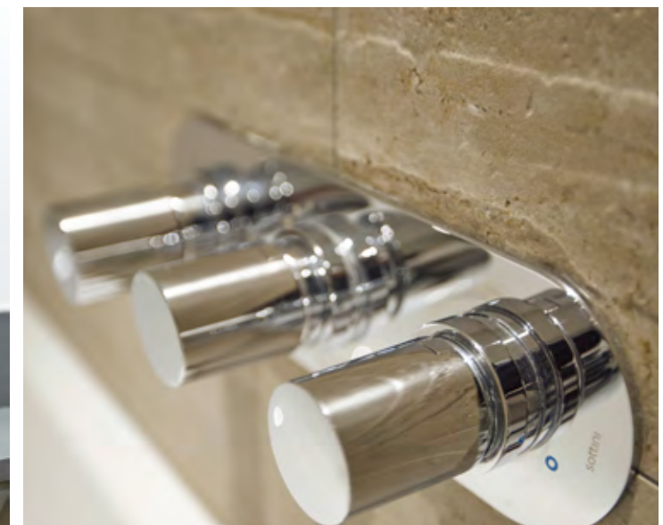
Photography of show apartment at Anthology Deptford Foundry.